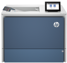
HP Color LaserJet Enterprise 5700dn Printer

This printer is intended to work only with cartridges that have a new or reused HP chip, and it uses dynamic security measures to block cartridges using a non-HP chip. Periodic firmware updates will maintain the effectiveness of these measures and block cartridges that previously worked. A reused HP chip enables the use of reused, remanufactured, and refilled cartridges. More at: http://www.hp.com/learn/ds